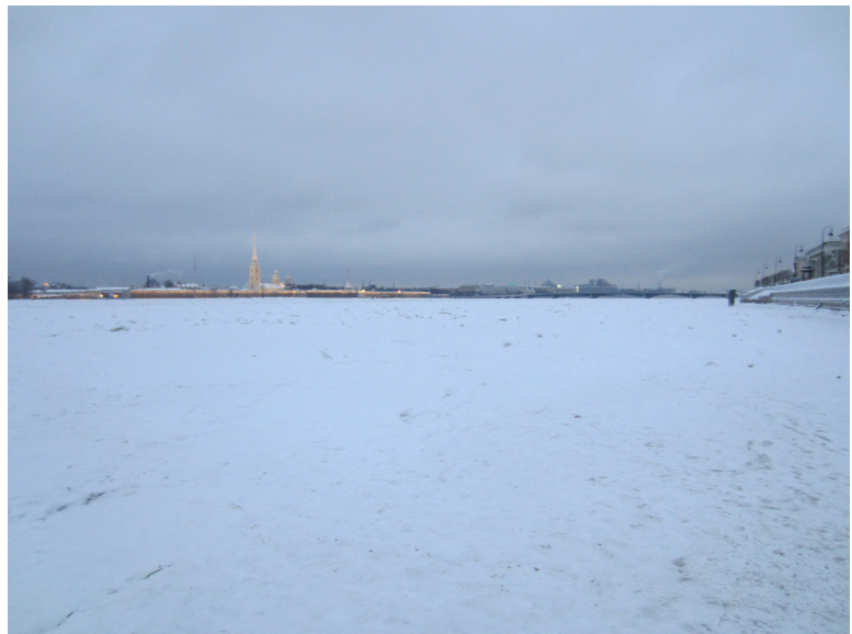
Illustration 2: Peter and Paul Fortress from the frozen Neva river

If I continue talking about the preparation of the travel, the most countries needs an invitation to do the visa, I received it one week before the official day to starts the classes, the 1 st of September, that's why I paid extra money to do my visa faster, but do it in the normal time and come late is not a problem because the first week of classes it doesn't real start. A second big point of preparing the travel, focus on the visa, you will receive the invitation for the Visa for 3 months, anyone says anything and is a little bit confuse at the beginning but when you are in Russia they will extend your Visa for the whole year, so you don't need to go outside of the country or something like this, like some friends I had in different countries.