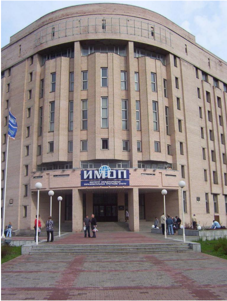
Illustration 3: IMOP's building

The mid part of this experience is the stay in Saint Petersburg, the beginning was a little bit difficult, you should know that is so different country, different culture so everyone needs some time to adapt, I have some friends in Saint Petersburg that they couldn't adapt making their stay so bad and some friends who could adapt having a really good experience here, but let's begin with the beginning of the stay.