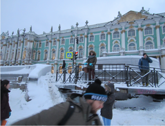
Illustration 4: Hermitage palace from the frozen river Neva

here are more than the academics things you can learn in the university. Discovering the hospitality of the Russian people. To finish give thanks to the LUH and DAAD to give me this great opportunity.